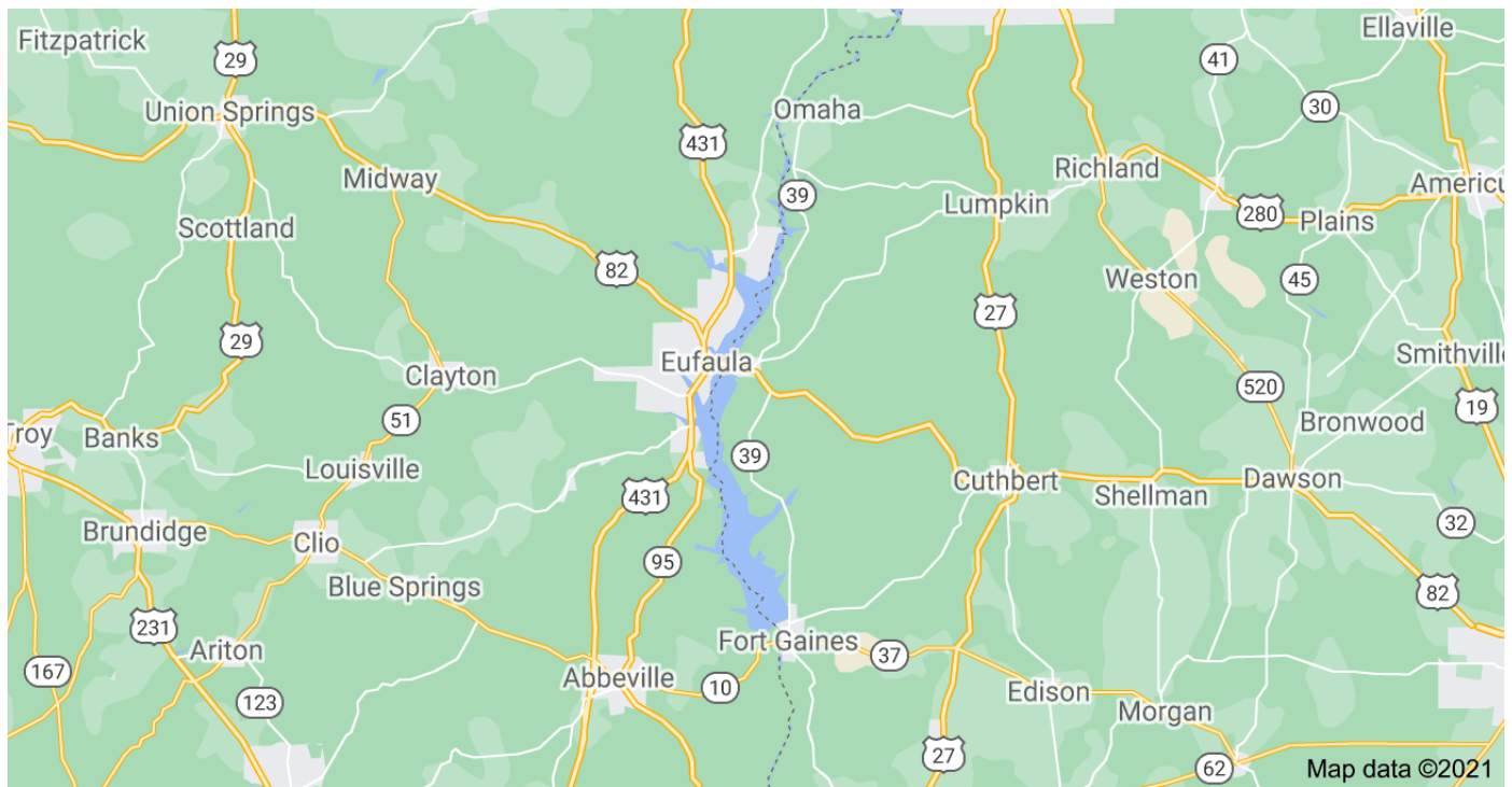
Figure 1: Geographical extent of Walter F. George Lake AL/GA.

Walter F. George Lake is maintained by the US Army Corps of Engineers. Nuisance growths of aquatic vegetation within Walter F. George Lake have caused varying levels of negative impacts on the beneficial uses of the system. Uncontrolled vegetation restricts navigation, hydropower generation, recreational use, water flows and reduces fish and wildlife habitat. The US Army Corps of Engineers has been applying herbicides to the vegetation since the 1970s to ensure that nuisance growths of aquatic vegetation do not impact the beneficial uses of the lake.