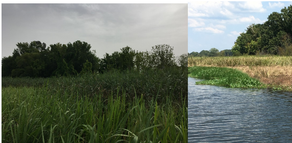
Figure 2: Aquatic Weeds on Walter F. George Lake AL/GA

Walter F. George Lake was formed by impounding the Chattahoochee River. The discharge from Walter F. George Dam forms George W. Andrews Lake.